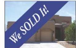
Jordan Rd. NE