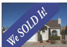
Samar Rd. NE