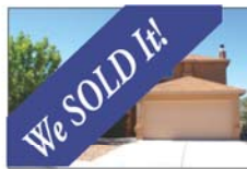
Irbid Rd. NE