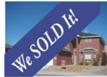
Irbid Rd. NE