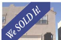
Alexandria Rd. NE