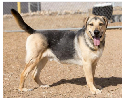
Simba is a German Shepherd/Lab mix who is about four years old.

Albuquerque and Bernalillo County animal shelters are at capacity, but cabq.gov makes it easy to search for a pet that meets your needs. At https://www.cabq.gov/pets/adoption/search-for-a-lost-or-adoptable-pet/search-for-a-lost-or-adoptable-pet , you can search by animal (cat/dog), age, gender, size, and color to see photos and breeds of the animals that are available.